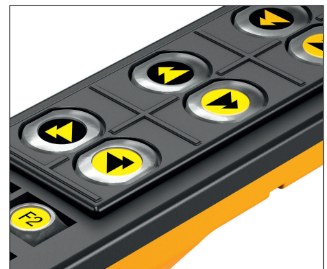
Features Illuminated Buttons