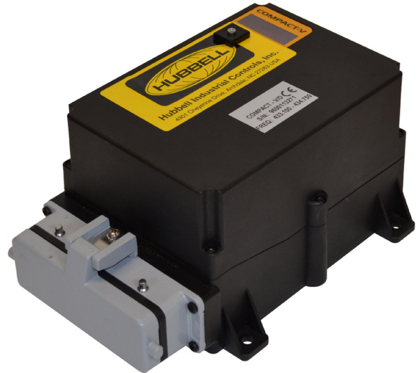
31.510 - AC Radio Control Receiver

External 25 feet of antenna cable and BNC connector